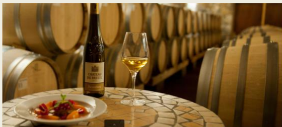
Anjou and Saumur wines

To book contact info@chateaudelacaillotiere.com +1 832 769 9668